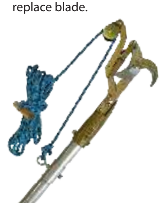
JA-34 Big Mouth 1.75" Cut Pruner Largest cutting capacity pruner (Shown with Pole Adapter)

The new Big Mouth Pruner has the same heavy duty construction of the JA-14, but it has a larger cutting capacity of 1.75". It also features a removable upper spring pin and blade bolt for easy blade replacement and sharpening - no more drilling out pins to