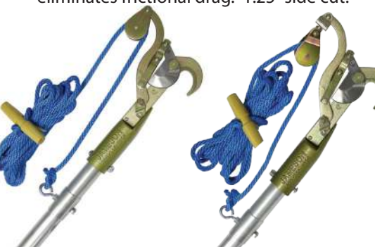
JA-14 Fixed Pulley Pruner 1.25" cut capacity (Shown with Pole Adapter)

Jameson's heavy duty JA-14 Pruners were designed for the professional arborist. Forged steel construction for added strength, an enhanced spring for smoother cutting action and a raised leading edge on hook eliminates frictional drag. 1.25" side cut.